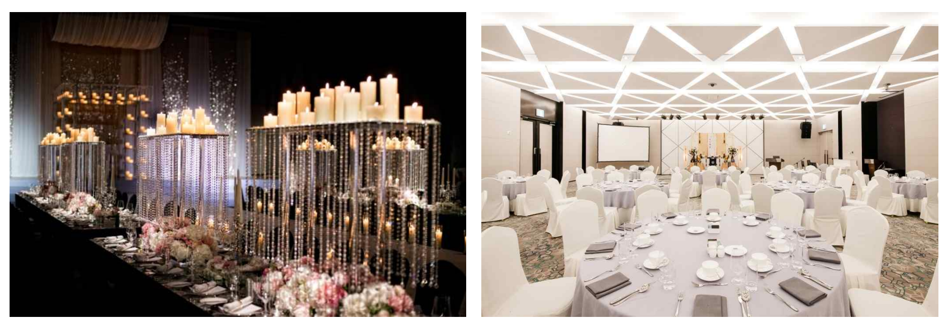
Grand Ballroom (Wedding Ceremony)