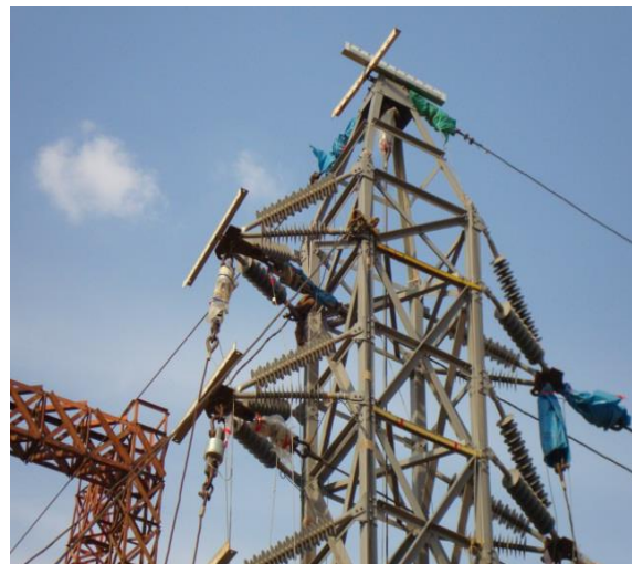
Fig.5, Calibrated load cells attached to the composite cross arm

During the tests, the loads are applied at the cross arm of the tower through pulley block system by means of flexible steel ropes, the tension is adjusted by electrical winches at the test control room.