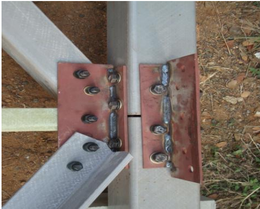
Fig.2. Photograph showing leg member joint

leg joints to improve the local bearing strength of individual highly loaded members as shown in Figure 3.