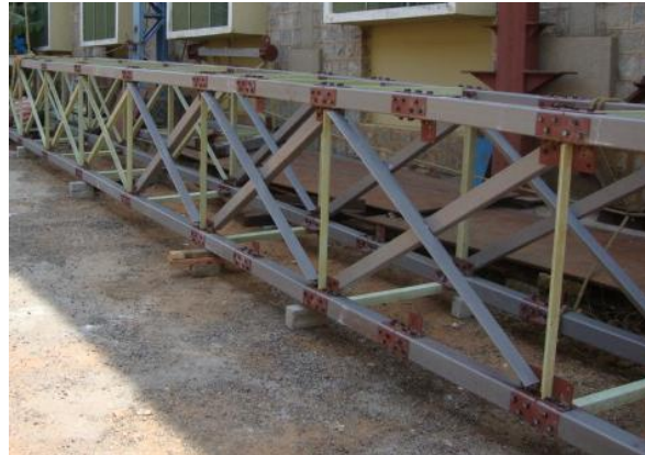
Fig.3. Photograph showing pultruded connection on a composite tower