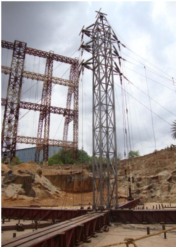
Fig. 4. Rigging arrangement of composite tower on the test bed

turn the validity of the tests the calibration of all instruments before the test is conducted. Load cells used for tower testing are calibrated in a systematic manner with the help of 600 kN capacity Universal Testing Machine. The calibration of load cells is carried out up to the maximum anticipated load to be applied during tower testing. To enable the application of the external loads in the most representative manner and simulate tower design conditions, the tower structure is rigged suitably. Impact of any variance in inclination of rigging wires with respect to the directions accounted for in design is considered while preparing rigging arrangement. The calibrated load cells are attached to the cross arm through the rigging wires positioned as close to the test tower so that frictional losses do not cause impact on the load cells during testing as illustrated in Figure 5. The electrically operated winches are connected to the control panel and they are operated by a remote from a centralized control room for applying loads at different points of tower structure.