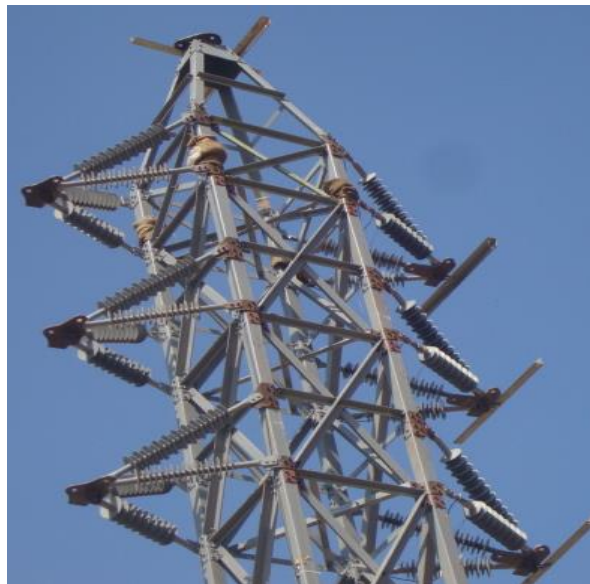
Fig.1. Photograph showing assembly of composite cross arm on tower body

The assembly of four structural elements, which is considered for the present study, is shown in Figure.1. The two horizontal elements with an open angle of 53 0 in horizontal plane resist longitudinal loads and transverse loads. The two suspension tie elements at an angle of 24 0 in vertical plane resist vertical loads and also avoid any uncertainty of the amount of stress distribution between two closely spaced members. Suitable end fittings were developed to enable fixing the composite cross arm on the tower body. The composite tower consist of leg members, bracing and cross arm members having different cross sections. They are assembled with suitable structural connections with steel plates and end clamps. Mechanical fasteners are used to join both the leg members of the tower and the cross arm to the pulling plate and to the tower body.